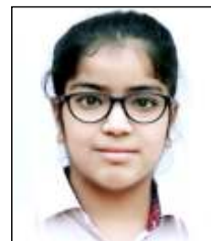
PALAK X (96.6%)

The only school in the District & Zone to get highest average score (QPI) and highest A1 Percentage.